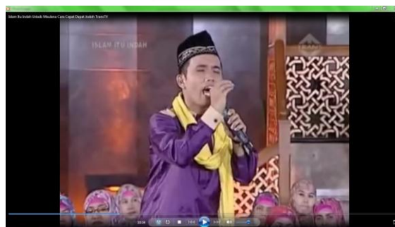
In picture 2, ustadz Maulana explained detail about a good woman in the world. He used low wafe gesture when he speak to audiences.