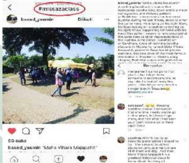
Figure 4.4 is explained that the group uploaded the picture about favorite place in the Maha Vihara Majapahit. From that picture and caption, it is concluded that she has the improvement in doing second task given by researcher. It can be seen that she wrote the caption by using English at least 150 words. Then, she gave the hashtag after writing caption, so the researcher will know that she has submitted the task in Instagram. In addition, there are various comments related to the picture. It can engage them to share their experience in the comment.