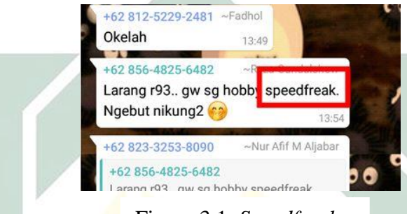
Figure 3.1 Speedfreak

This conversation took place at 13:54 on March 5, 2018. Figure 3.1 is obtained by the researcher from conversations in a WhatsApp group that talk about their motorcycle tires.