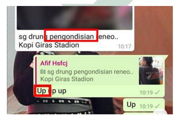
Figure 4.6 Pengkondisian and Up

March 15, 2018, at 10.19 the researcher got this data. Figure 4.6 is a screenshot of the conversation in the HSFCJ WhatsApp group. The conversation tells about the notification to all members to gather somewhere.