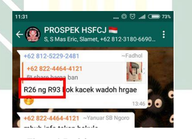
Figure 4.7 R26

March 07 2018 at 1:46 p.m. the researcher got the conversation data below. the conversation in the figure below talks about the price of a motorcycle tool.