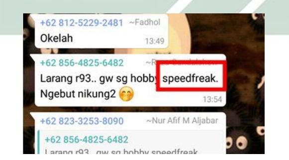
Figure 4.3 Speedfreak

This conversation took place at 13:54 on March 5, 2018. Figure 4.3 is obtained by the researcher from conversations in a WhatsApp group that talk about their motorcycle tires.