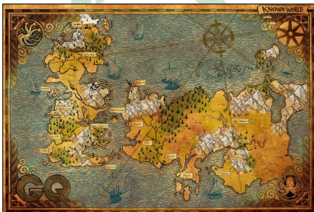
Figure 3.1: Map of A Game of Thrones World

In this chapter, the researcher analyzes Daenerys Targaryen's struggle based on the data from A Game of Thrones . The researcher divides the analysis into two parts. The first is Daenerys Targaryen's journey to becoming a khalasar leader, while the second is the effect of Daenerys Targaryen's struggle towards her personality. For a better understanding, the researcher provides a bit synopsis of Daenerys' story and the map of A Game of Thrones world.