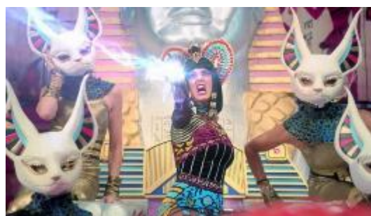
Figure 10. Magic