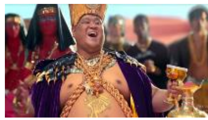
Figure 5. The Second Suitor King