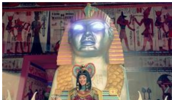
Figure 3. A Sphinx-shaped throne