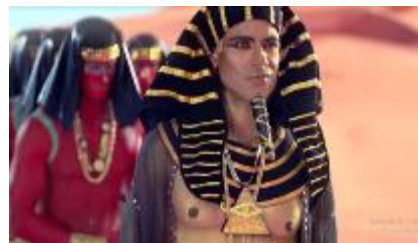
Figure 8. Fifth Suitor King