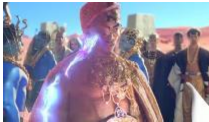
Figure 4. The First Suitor King