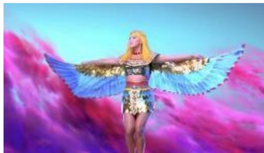
Figure 11. Wings Costume