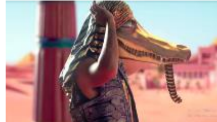
Figure 7. Fourth Suitor King