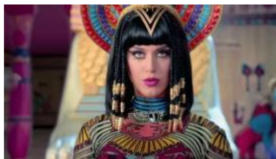
Figure 1. Cleopatra's Costume