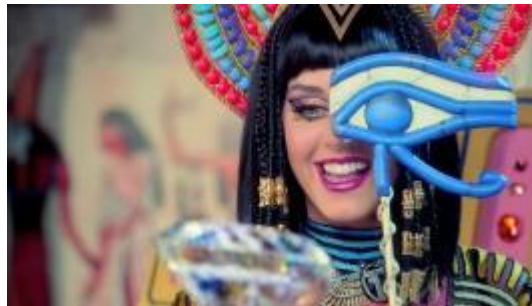
Figure 9. The Eye of Horus Symbol