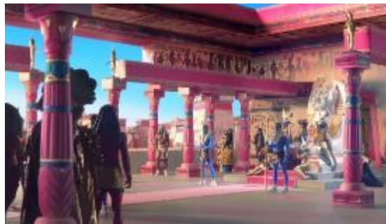
Figure 2. Katy Perry as The Queen in The Palace