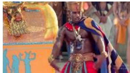
Figure 6. Third Suitor King