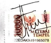
Fauzia Cahya Islami D05219009

Surabaya, 23 Juni 2023 Yang membuat pernyataan,