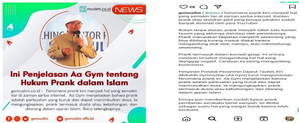
Figure 3: Pranks according to Aa Gym in Islam

In this context, Aa Gym strongly condemned pranks as harmful behavior that goes against Islamic values. On July 6, 2022, the Indonesian government proposed a special article in the Criminal Code Bill prohibiting pranks that cause harm to victims. 26 Aa Gym supports this policy and emphasizes that pranks are despicable acts that carry sin because they involve lies and deceit. This statement reaffirms his position as a cleric who consistently defends moral values and opposes deviant behavior in the digital society.