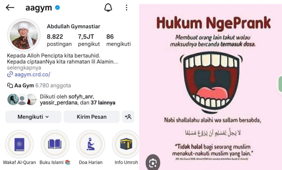
Figure 2. Aa Gym's Instagram account and hadith meme about pranks

Aa Gym carefully crafts his communication with social media audiences using a simple, inclusive, and easily understandable language style. His approach, which combines humor and moral wisdom, is a major strength in attracting attention, especially among the younger generation, who are the dominant users of digital media. In addition, the use of attractive visual elements and short video formats that are easily accessible is an effective strategy for delivering da'wah messages quickly and massively. 22