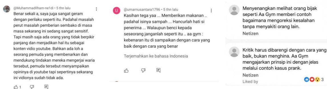
Figure 4: Screenshot of several netizen comments on Aa Gym's explanation of the prank

This analysis indicates that Aa Gym's YouTube audience tends to come from religious circles and places ethics as a key principle, so that religious messages related to the prohibition of pranks receive significant support. However, a segment of viewers still views pranks from an entertainment perspective, so they consider that this practice is not always negative. This diversity of perspectives, rather than diminishing the effectiveness of the religious messages, has the potential to spark constructive discussions in the comment section, which in turn can increase engagement and expand the reach of the content on the platform.