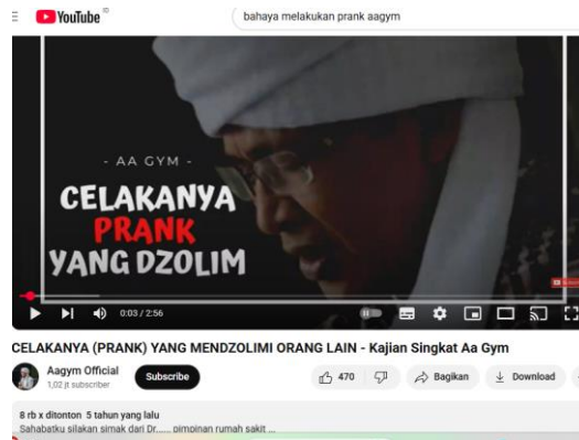
Figure 4. Aa Gym's explanation of the prank.