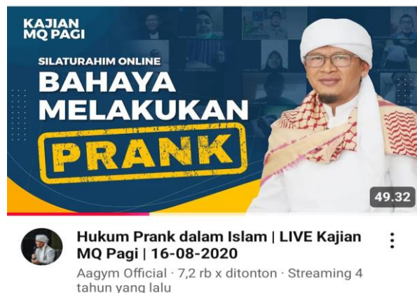
Figure 5: Aa Gym's explanation about the prank

Through a study of the title "Controversy over Pranks on Social Media According to Aa Gym: A Study of Joking Hadiths from the Perspective of Norman Fairclough's Critical Discourse Analysis," the exploration of text structure highlights the selection of diction that is rich in moral, religious, and religious authority values. The choice of words and sentence structure reflects the normative position that he wants to emphasize while also building an emotional relationship with the audience. This analysis also highlights the importance of understanding the text production process, namely, the social and cultural context that shapes the background of the sermon. This approach examines not only the explicit meaning of the text but also the implicit meaning that contains ideological interests and the power relations between the speaker and the audience.